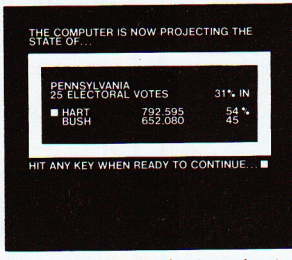
The computer makes its election night projections.